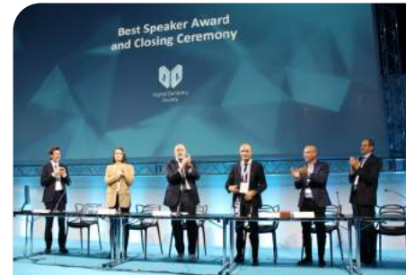
DDS Global Congress