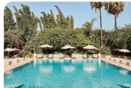
The beautiful Casablanca and the Congress Venue, the Hyatt Regency Hotel