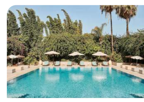
The beautiful Casablanca and the Congess Venue, the Hyatt Regency Hotel